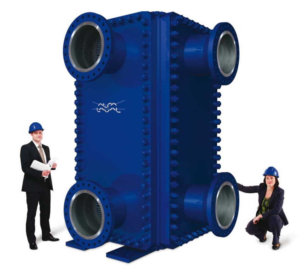
The Compabloc 120 fully welded compact heat exchanger from Alfa Laval

At Achema 2009, Alfa Laval introduced the Compabloc 120 fully welded compact heat exchanger (CHE), the largest member of its Compabloc family. Like the other family members, the highly compact Compabloc 120 makes reducing CO_2 emissions not just achievable, but profitable due to the energy savings it offers, combined