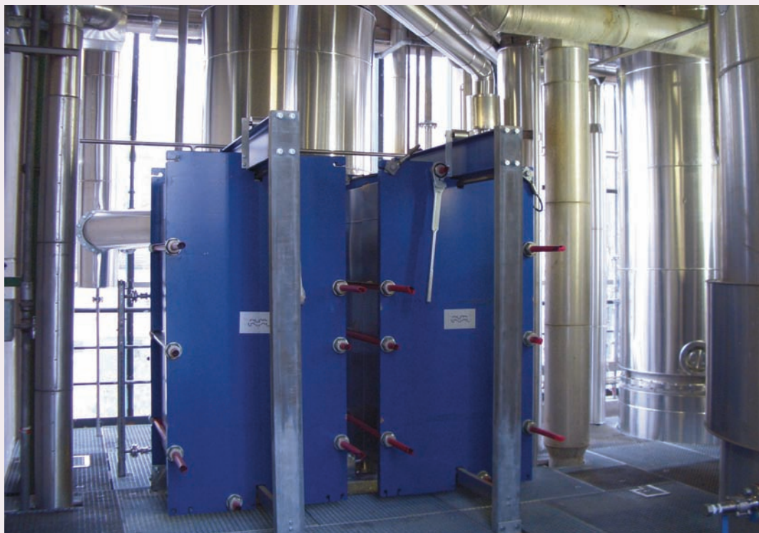
Compact installation of the reboilers on one floor