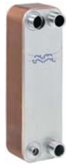
Brazed plate heat exchangers

Brazed plate heat exchangers (BHE's) have stainless steel plates, copper brazed for high thermal efficiency and strength. Designed for refrigeration and AC duties, BHE's handle H(C)FC, HFC, HC and CO 2 refrigerants. As dry expansion evaporators they feature integrated flow equalization for maximum cooling performance. Three models are equipped with double refrigerant circuits. Temperature range: -100°C to 200°C; pressure ratings up to 130 bar.