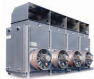
Industrial air coolers

Exceptionally wide and deep air cooler ranges in a variety of material combinations, such as copper tubing for H(C)FC refrigerants and stainless steel tubing, or fully galvanized coils for ammonia applications. Dedicated ranges for indirect systems (brines) and CO 2 applications. Industrial air coolers are available in standardized modular ranges (single/dual air discharge) or fully customized for the application. Designed for cold rooms with fresh or frozen goods with room temperatures from 20°C to -40°C.