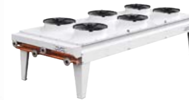
Air cooled condensers, liquid coolers, gas coolers

The products are available for both horizontal and vertical air direction, either in single or dual coil execution. Also available in V-design. Suitable for applications in HVAC, refrigeration, process and power industries.