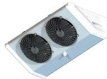
Commercial air coolers

Highly standardized commercial air cooler ranges in a variety of configurations and designs, including single, dual and multi-discharge models. A wide range of models is available from stock. Dedicated ranges for indirect systems (brines) and CO 2 applications. Designed for small to medium-sized cold rooms with fresh or frozen goods, with room temperatures from 20°C to -35°C.