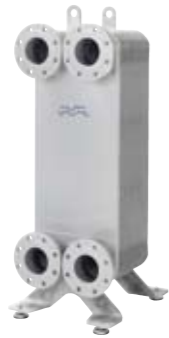
Fusion-bonded plate heat exchangers

AlfaNova is a plate heat exchanger made of 100% stainless steel. It is based on Alfa Laval's new, revolutionary technology, AlfaFusion, the art of joining stainless steel components together. AlfaNova heat exchangers are well suited to applications which put high demands on cleanliness, applications where ammonia is used or applications where copper or nickel contamination is unacceptable. Particularly suitable as an NH 3 chiller compressor oil cooler.