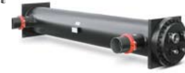
Shell-and-tube condensers and evaporators

Alfa Laval Shell-and-tube condensers and evaporators cover a wide range of refrigeration applications. First-class materials ensure accurate refrigerant distribution. Condensers are available in a marine version with Cu-Ni tubes and tube sheets in stainless steel and also as desuperheaters. A special condenser version is available for glide refrigerant R407C.