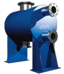
All-welded plate heat exchanger AlfaDisc

AlfaDisc is adapted to handle all refrigerants and single-phase fluids with pressures of up to 100 bar and temperatures from -60°C to 200°C. AlfaDisc is designed for use as an ammonia-flooded evaporator and condenser. It can also be used as a high-pressure CO 2 condenser, cooled by the evaporating refrigerant – a so-called cascade heat exchanger. It can be further adapted to perform tasks such as oil cooling using natural refrigerants and condensate subcooling using refrigerants or cooling water.