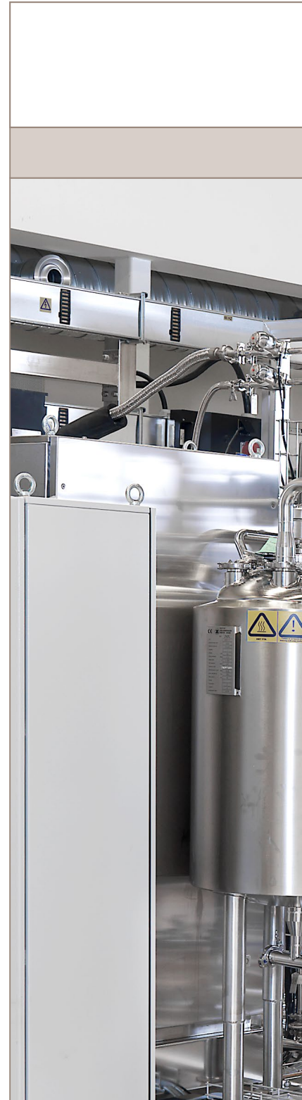
ALFA LIVAL is a trademark registered and owned by Alfa Laval Corporate AB.

Up-to-date Alfa Laval contact details for all countries are always available on our website at www.alfalaval.com .