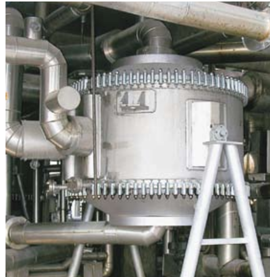
Germany: Slurry oil cooling