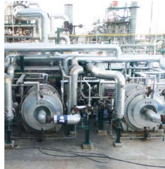
Spain: Feed preheating at vacuum distillation and cooling of fuel oil after Visbreaker

Savings in maintenance-related costs alone were approximately € 500,000 over a period of 15 months.