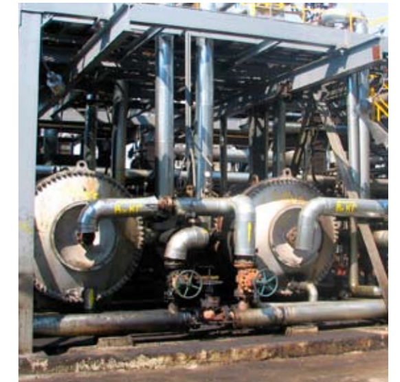
Bulgaria: Spiral heat exchangers replace S&Ts for Visbreaking bottom cooling duties

A refinery replaced 24 S&Ts with four Alfa Laval HPSHEs for Visbreaking bottom cooling duties. Installed in 2008, when first opened one year later they showed no signs of fouling. There has been an increase in the conversion rate from 54% to 80% and the process is very stable.