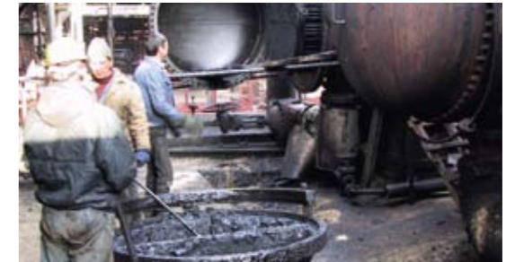
A shell-and-tube heat exchanger (S&T) after three months' operation in a fouling process.

HPSHEs can be serviced during a refinery's general shutdown, every three to four years. They can be cleaned quickly and simply by backflushing, hydroblasting or in-line chemical cleaning. There is an Alfa Laval Cleaning-in-Place system designed for this duty.