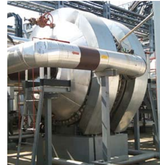
Ukraine: Spiral heat exchangers for Visbreaking unit

The results were lower maintenance costs and higher heat recovery.