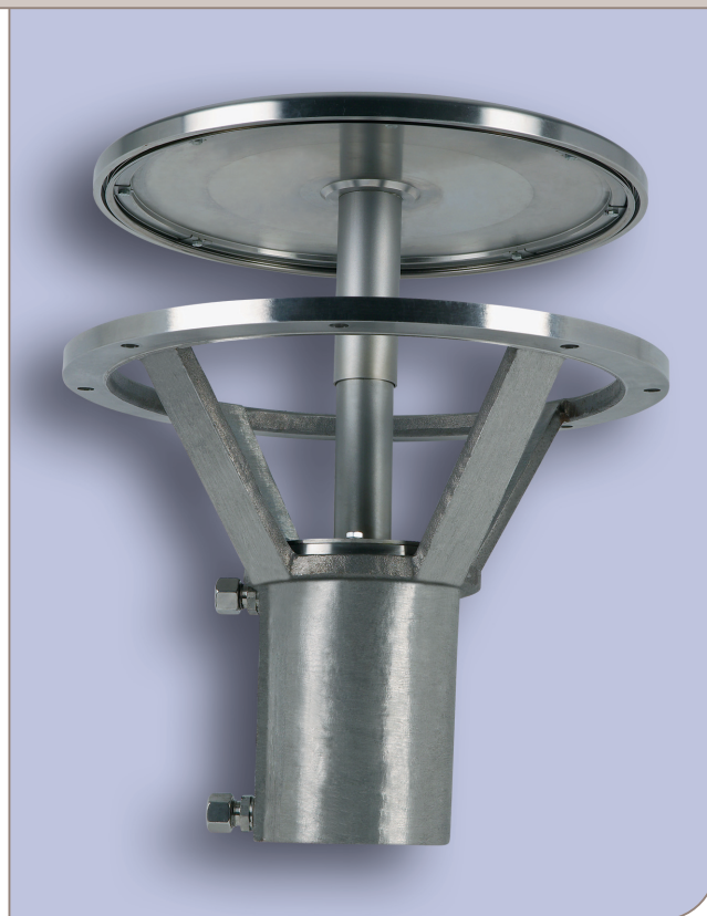
FDV Valve model 303 in open position

The valve seal consists of a resilient metal convolution in a "floating" mount (pat. pending) that keeps it free from tension. The surfaces are ground and lapped. This seal can withstand high temperatures and exerts a high sealing pressure. It can also