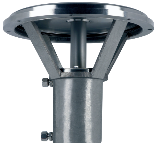
FDV Valve model 303 in closed position

Each valve is supplied with a pre-assembled control box. Actuated ball valves are used for steam and vacuum. These valves are prepared for manual operation if this should be needed.